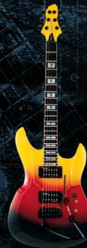
3-Tone Fireburst w/ Black Hardware