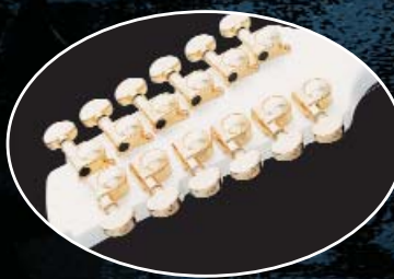
Gold Grover Tuners Top off this beautiful 12 string guitar