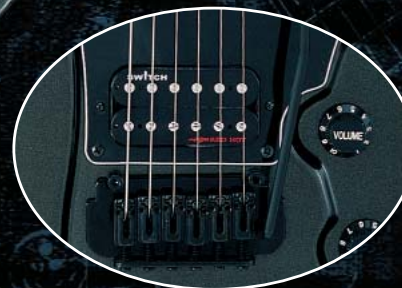
Stein-III Roller-Saddle Tremolo