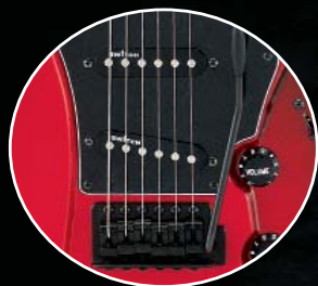
Strav-II's Standard Tremolo Bridge

The Strav-II delivers the traditional three single coil pick-up sound with the purity and sustain that can only be achieved with Vibracell. A traditional five-way pickup selector combined with a single volume and dual tone controls selects and blends the pick-ups. A 22 fret, 25 1/2 inch scale with a traditional Rosewood fingerboard gives the player a familiar feel. The one piece Vibracell 3D aggressive body gives the player individuality. Six on a side headstock with Grover's tuning machines, standard tremolo bridge and black hardware are standard features.