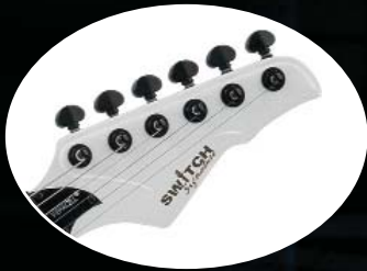
Grover Tuners 6 on a Side Headstock

The Stein-III Signature is designed for the player with serious attitude and style. All the same features as the Stein-III but with an Ebonite fingerboard. Ebonite combined with Switch's Patented Vibracell technology delivers energy from the neck to the body up to four times faster than traditional fingerboards. The result is extreme sustain and clarity with pure driving power. Black hardware, Six on a Side headstock with Grover tuning machines, faux pearl and abalone block inlays are standard features. 3D Vibracell body available in a choice of Firemist and Metallic Finishes.