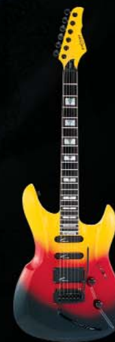
3-Tone Fireburst w/ Black Hardware