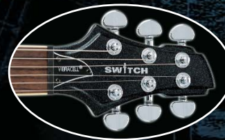
Grover Tuners 3 on a Side Headstock