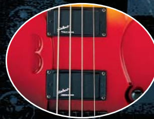
EMG Select Bass Pickups